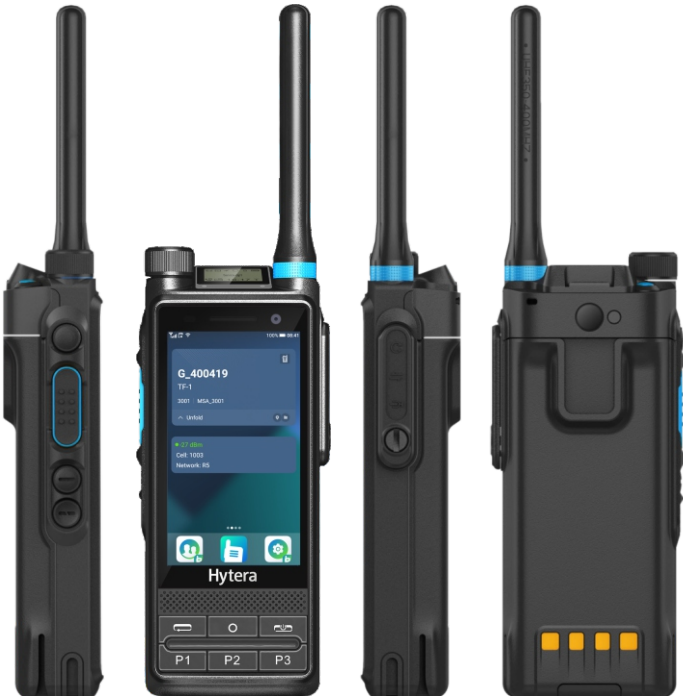
PTC680 multi-mode advanced radios

The first type is the smart radio supporting full PMR trunking services, such as the Hytera PDC760, PTC760 and PTC680 multi-mode advanced radios. These radios embed a narrowband platform and a broadband Android platform. As a result, they can simultaneously work as an Android smartphone and a PMR two-way radio. These radios not only provide reliable mission-critical voice services, but also deliver rich multimedia services such as video calling and video uploading in real-time.